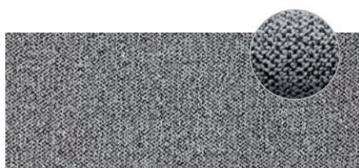
WSS WHITE STAR