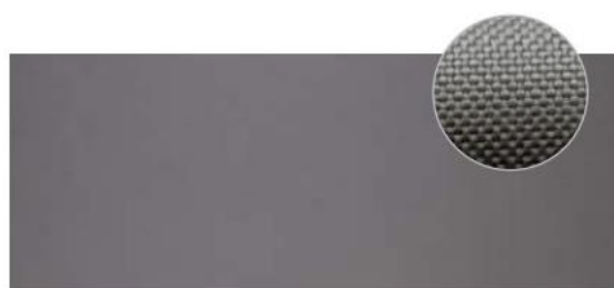
TPS TAUPE / TALPA