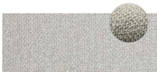
CSS CREAM STAR