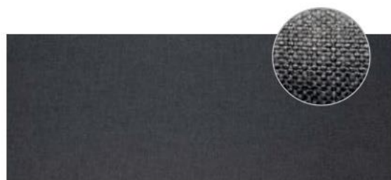
ANS ANTHRACITE / ANTRACITE