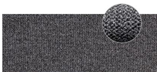
FSS GREY MUD STAR