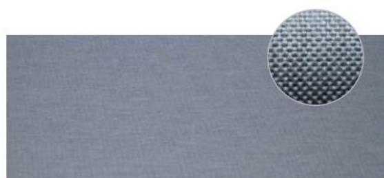
GRS GREY / GRIGIO