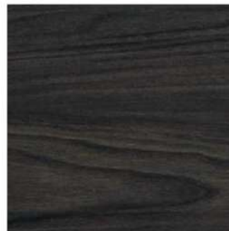
3 noce ardesia / ardesia walnut