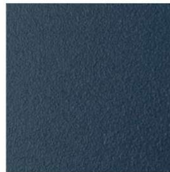
US blu sablé / sandblasted blue