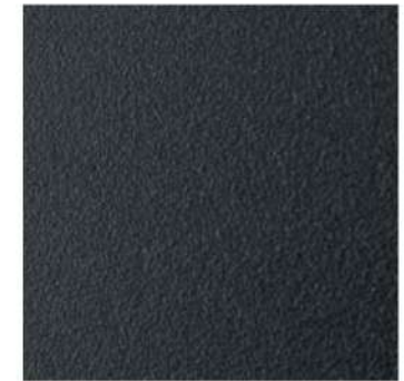
AS grigio ardesia sablé / sandblasted ardesia grey