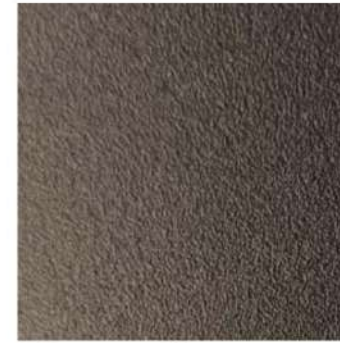
ZS bronzo sablé / sandblasted bronze