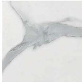
12 marmo bianco fiorentino / florentine white marble