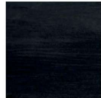
9 nero carbone / carbon black