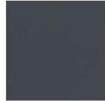
5 grigio ardesia / ardesia grey