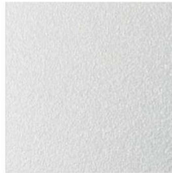
BS bianco sablé / sandblasted white