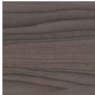
1 noce / walnut