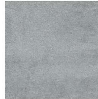
11 cemento / concrete