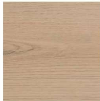
2 rovere naturale / natural oak