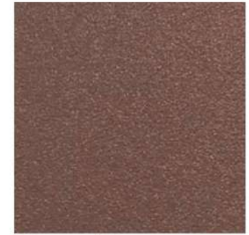
RS rame sablé / sandblasted copper