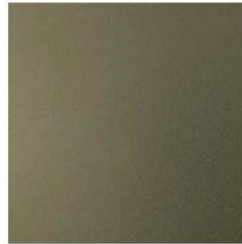
BM bronzo metallux / metallux light bronze

Sandblasted matte finishings obtained by melting powdered epoxy varnish on the metal at temperature of 180°. Thanks to this process, varnish penetrates deep into the cavities of the material to ensure perfect fixing and effective resistance.