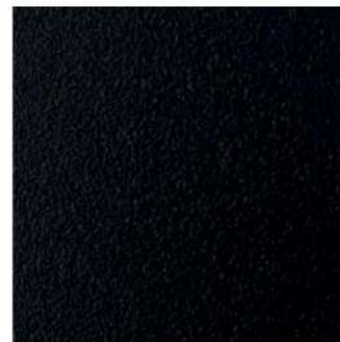
NS nero sablé / sandblasted black