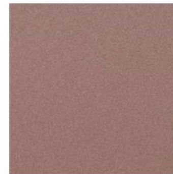
CS cipria sablé / sandblasted cipria